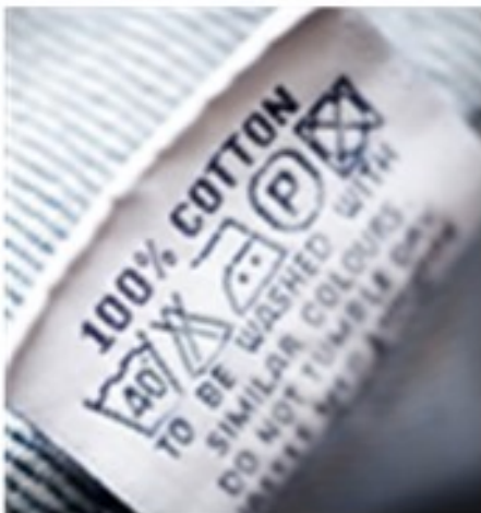
Figure 2: Examples of labelling