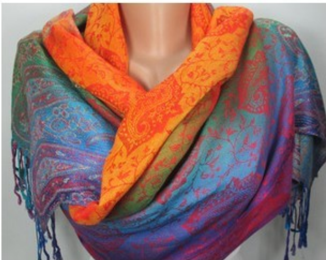
Figure 1: Scarves are popular fashion accessories in Europe

In this study, fashion accessories are defined as gloves, mittens, mitts, neckwear, carrying products such as bags, and other accessories such as handkerchiefs, belts, hats and caps. Jewellery is excluded from this report.