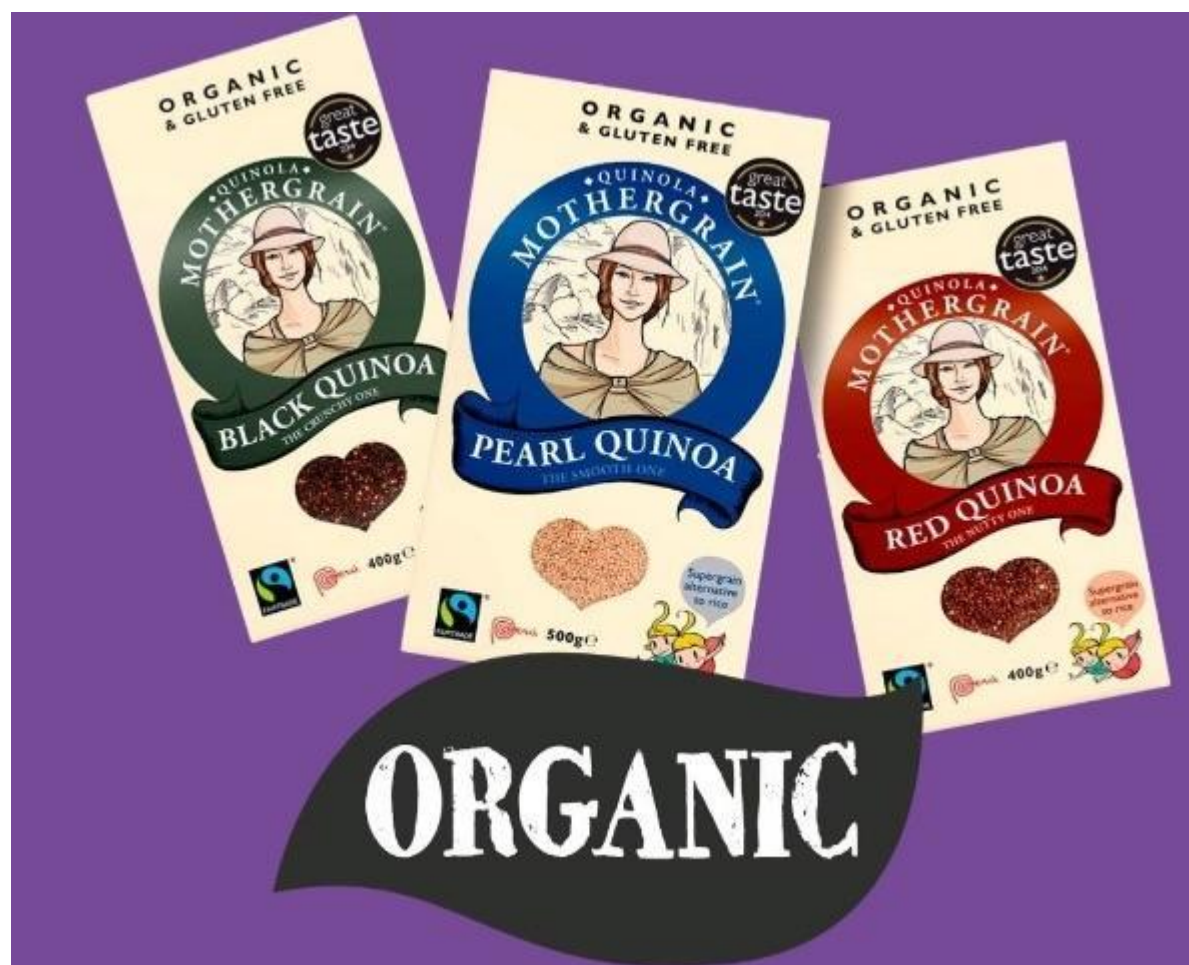
Figure 4: Double-certified quinoa products of the British BCorp certified company Quinola