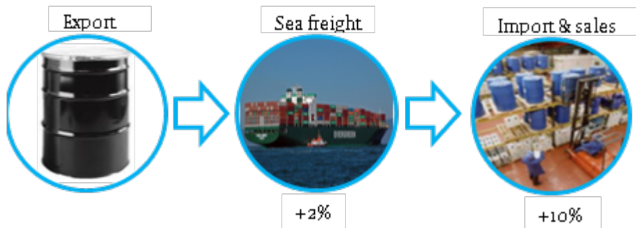
Figure 4: Price breakdown for liquorice extract, mark-ups in %

Based on Full Container Loads from Central Asia to European importer