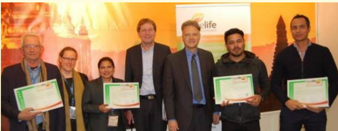
Figure 13: Travelife Awards

In 2023 Jordan Geography was the first tour operator in Jordan to become Travelife-certified. The process was time-consuming and lengthy, but one that they feel has produced great impact on the team and the organisation as a whole.