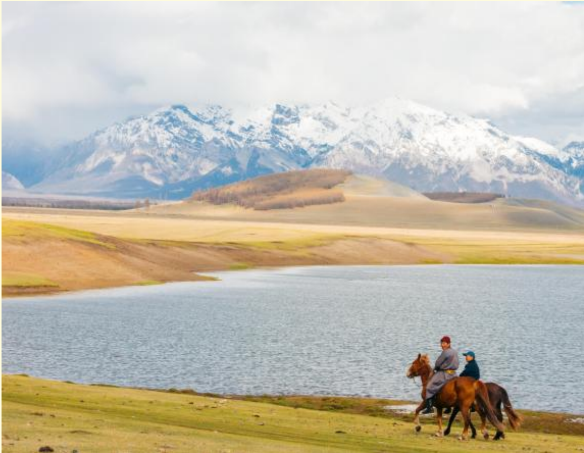
Figure 3: Horse Riding Experience

In response to these issues, the team connected with students at the Responsible Tourism Management Postgraduate programme of Leeds Beckett University, UK . Together they developed an Environmental Management Plan for the Eternal Landscapes office and a Resilience Report. This included a thorough review of the environmental impacts of Eternal Landscapes activities in the region.