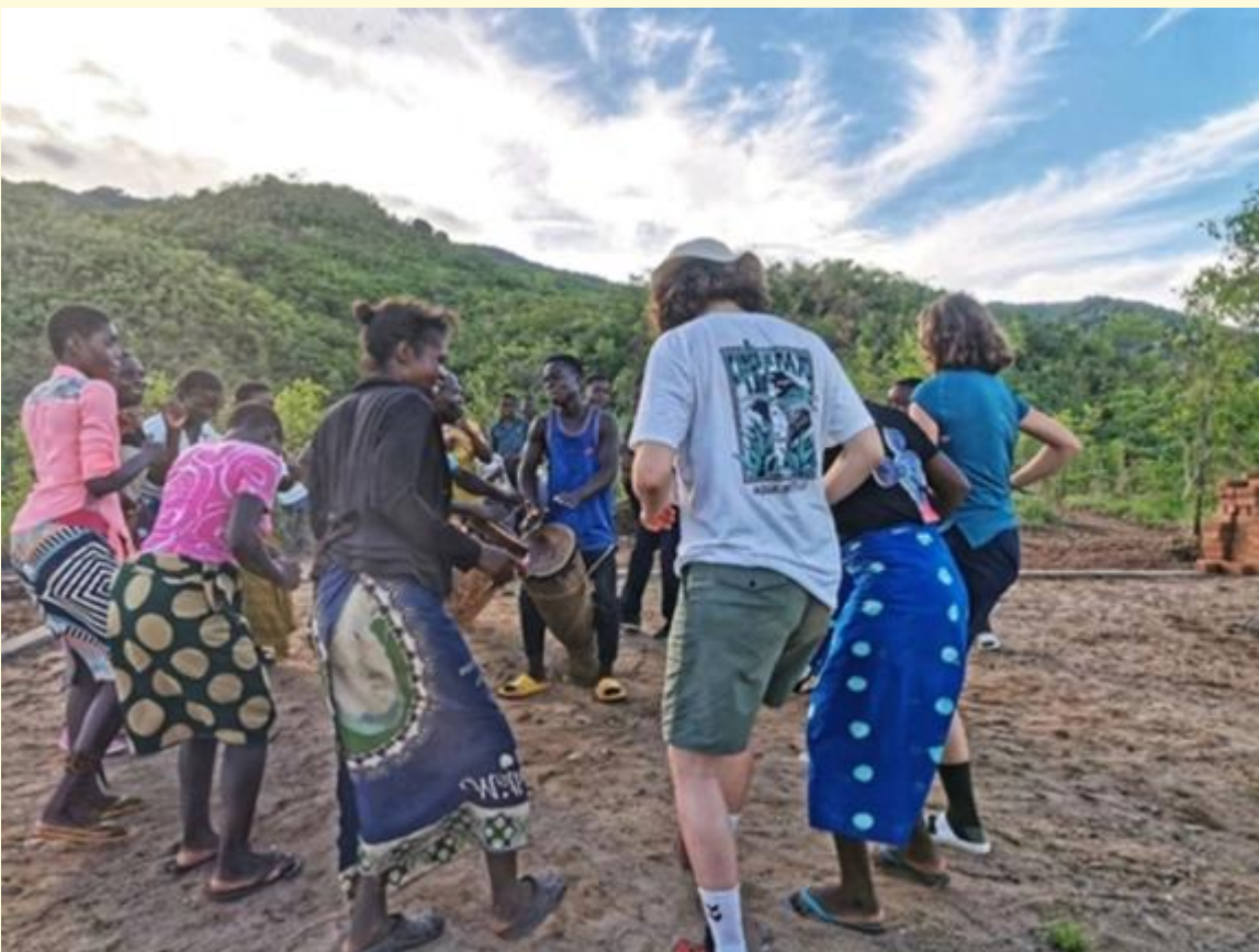
Figure 8: Cultural experience

To support local tourism development and sustainability, they have begun to develop community-owned campsites across Malawi. This initiative was developed in partnership with GIZ (Deutsche Gesellschaft für Internationale Zusammenarbeit) , a German sustainable development organisation.