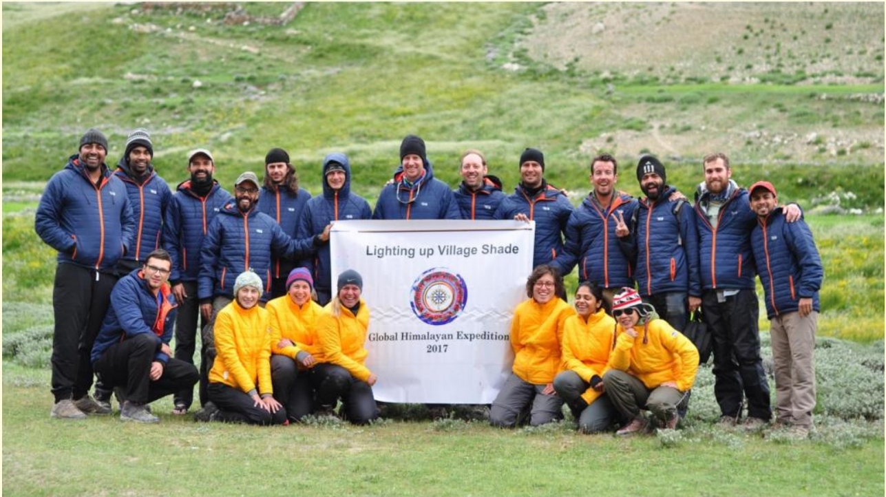
Figure 4: 2017 Expedition