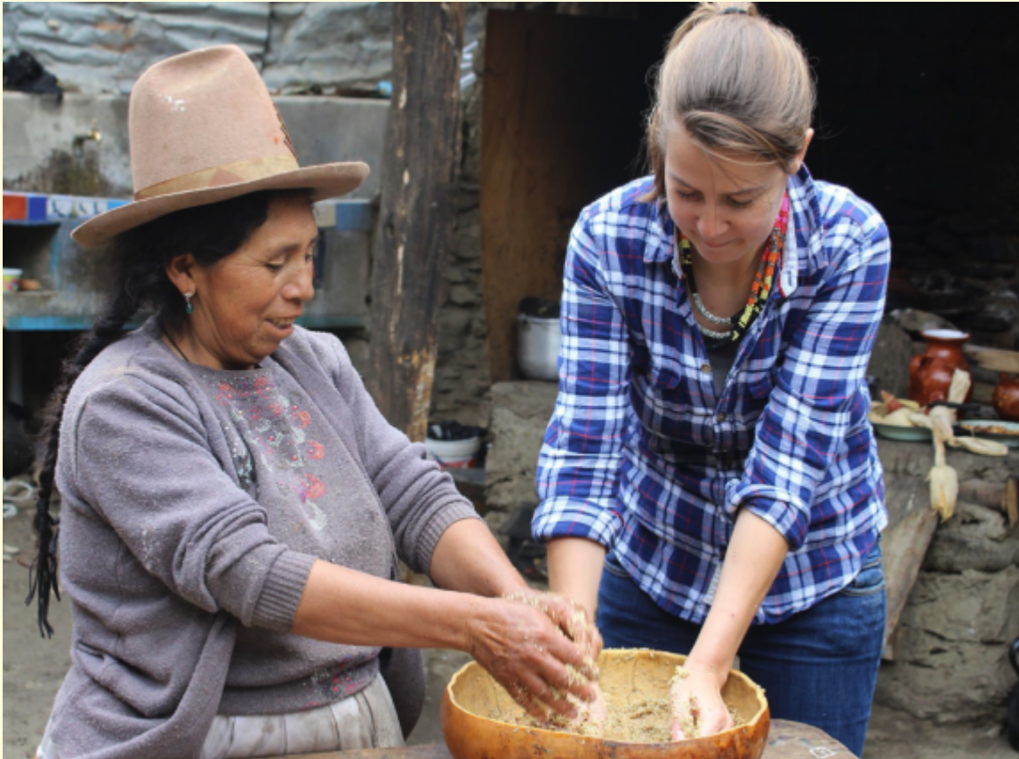
Figure 9: Cooking class

Alternative Peru focusses 100% on responsible and sustainable tourism. They are a registered BIC (Company for the Collective Benefit and Interest), with the purpose of creating positive social, economic and environmental value in the communities they visit and work with.