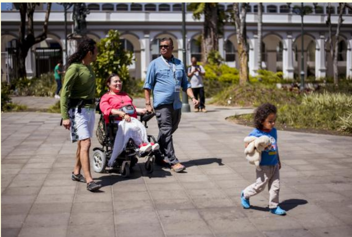
Figure 6: Accessible Travel

Over the years, Il Viaggio Travel has advocated for accessibility standards, influencing suppliers to adapt their products accordingly. As a result, they now offer the same Costa Rica experience to travellers with and without physical disabilities.