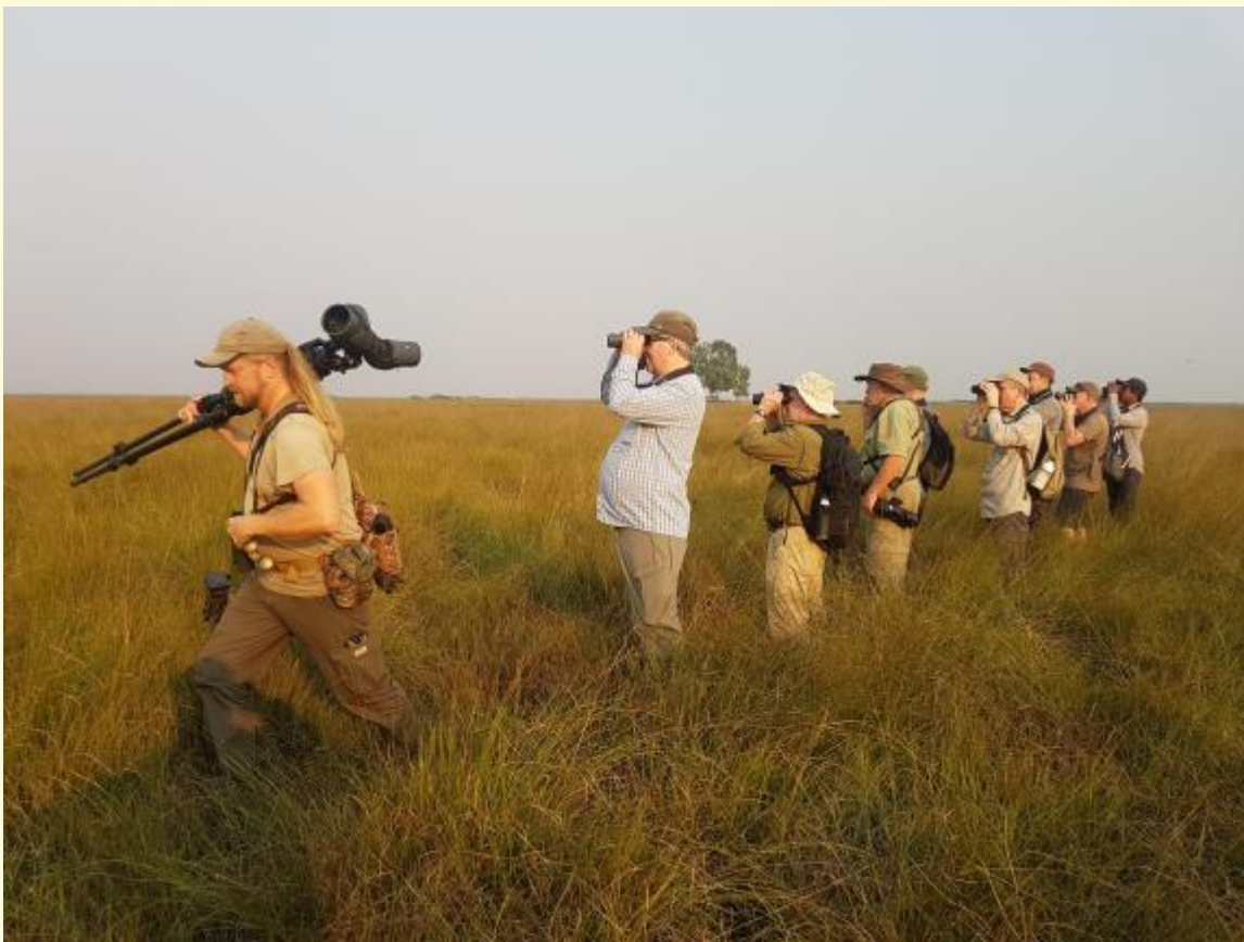
Figure 2: Clients enjoying birdwatching