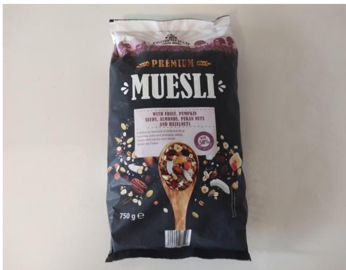
Figure 5: Premium muesli containing dried pineapple sold by German retailer Lidl

Apart from snacks, dried pineapple is an ingredient of breakfast cereal mixtures. Nevertheless, the usage of sweetened pineapple in breakfast cereals is larger than that of natural dried pineapple. However, it is expected that no-added-sugar dried fruit in breakfast cereals will overtake sugar-infused fruit soon.