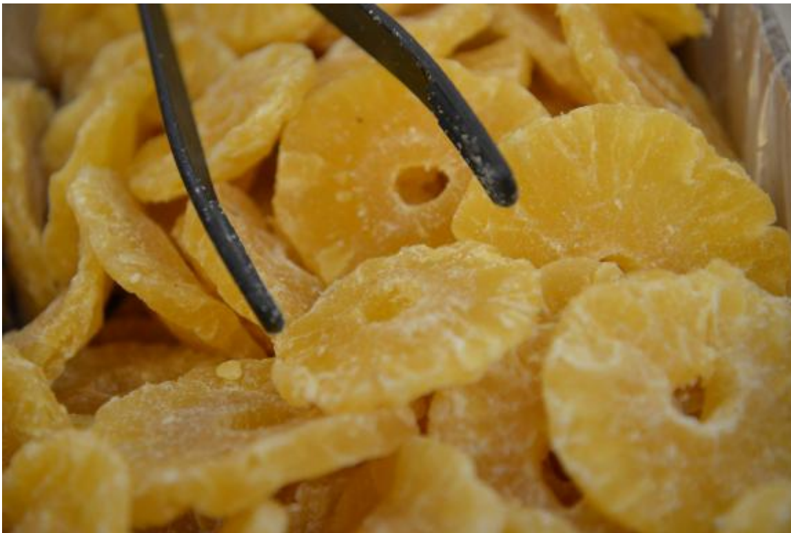
Figure 1: Dried pineapple pieces