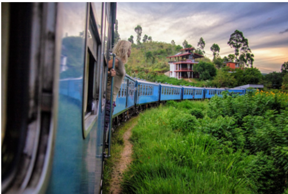
Figure 6: Train travel in Sri Lanka

There are lots of beautiful places to visit in Sri Lanka, and the country is welcoming to people travelling alone. It is not too expensive, making it attractive to travellers on a variety of budgets. Solo travellers can see ancient temples and stunning nature, and enjoy the warm hospitality of the local people. Getting around is easy, and there are many things to do, like hiking, going on safaris or just relaxing on the beach. Additionally, most people can understand and speak English, which makes communication easier.