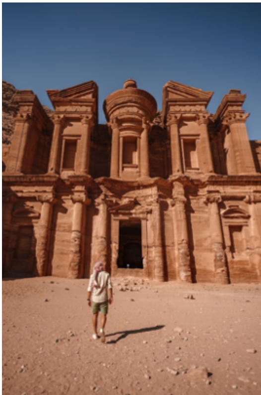
Figure 7: Enjoying Petra solo in Jordan

Solo travellers in Jordan can choose from more than 1,300 hostels, with an average rating of 8.76 out of 10. Additionally, Jordan is renowned for its safety and the friendliness of its people, making it a comfortable and welcoming destination for solo travellers. The country has well-maintained roads and reliable public transport, allowing solo travellers to get around easily without paying for private transfers.