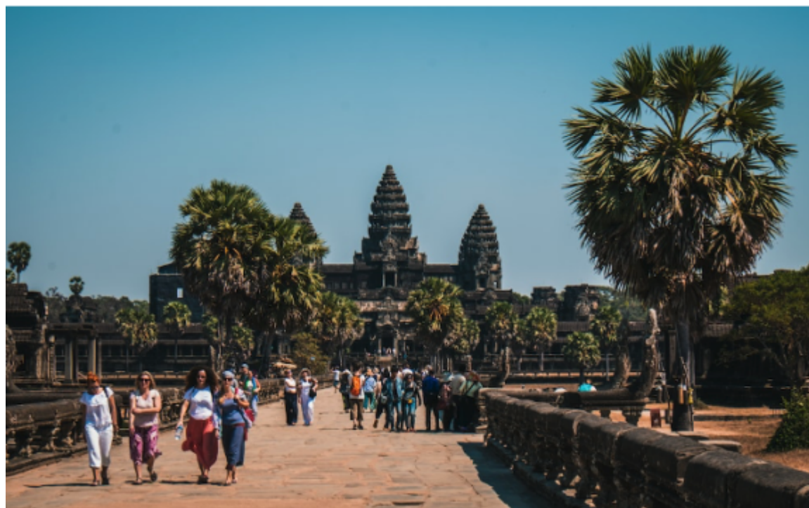
Figure 5: Never alone at Angkor Wat, Cambodia

has more than 1,100 hotels, and the average price for solo travellers is $60.70 per night. Moreover, an average day trip costs only $41. It must be noted, however, that Cambodia is relatively unsafe compared to some other countries. If this were to improve, it could rank even higher.