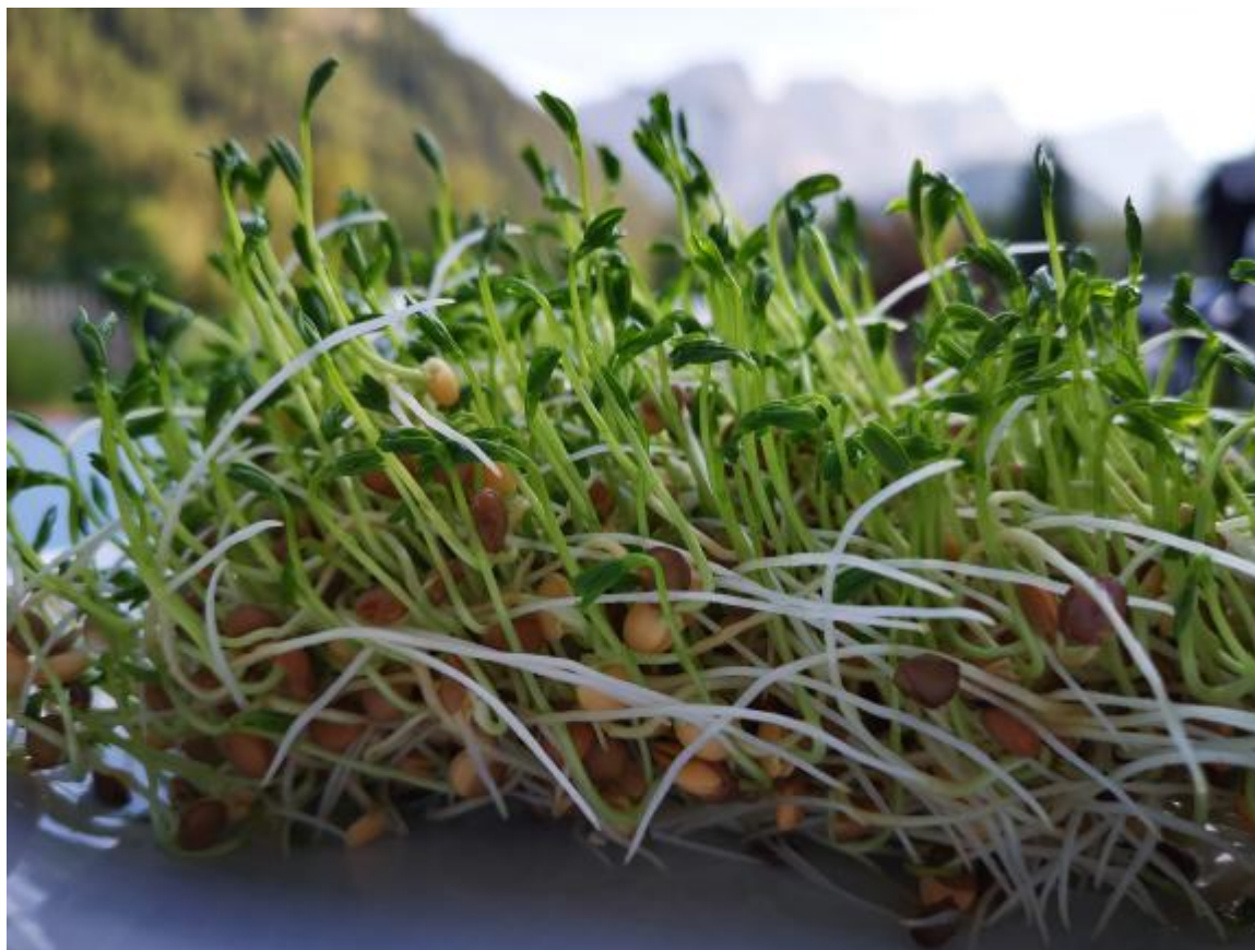
Figure 2: Lentil sprouts