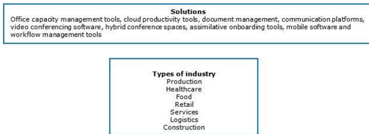
Figure 1: Horizontal and vertical market segments with opportunities for hybrid workspace technology

Please note that this Figure does not give a complete overview and only covers software development for hybrid workspace technology. There are also opportunities for product development. These are mentioned below in the running text about trade channels under the sub-header 'Direct sales and online marketplaces'.