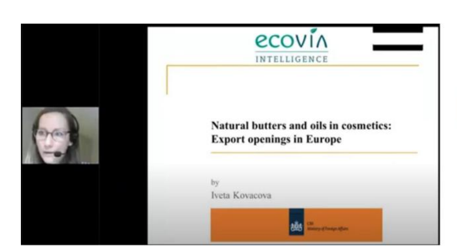
Figure 5: CBI webinars for natural ingredients for cosmetics

Webinars and their recordings, which allow speakers to deliver and share presentations while answering questions, are being made available digitally. These webinars contain information about the latest news, trends and developments. For example, CBI holds webinars for natural ingredients for cosmetics such as Export openings in Europe and Natural butters and oils in cosmetics: Export openings in Europe.