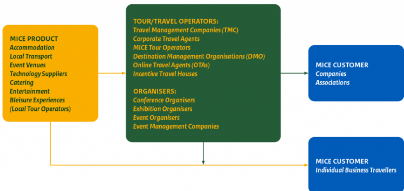
Figure 4: Sales Channels for MICE

OTAs are also often used by individual business travellers who make their own direct arrangements for their leisure time.