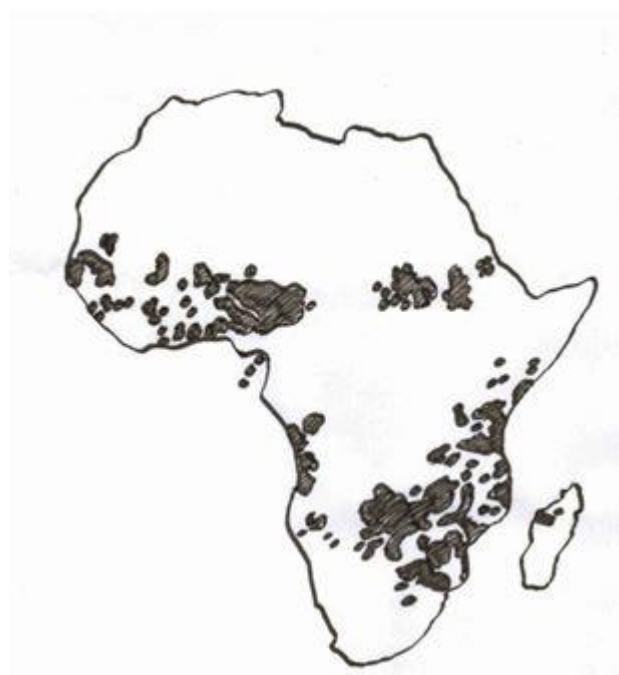
Figure 1: Distribution of baobab trees in Africa

The Adansonia digitata tree which provides the kernel of the baobab seed from which baobab oil is extracted is native to Senegal, Zimbabwe, South Africa, Benin, Sudan, Kenya, Botswana, Madagascar, Angola, Namibia and Zambia. Commercial production of baobab oil mainly takes place in Zimbabwe, South Africa, Senegal and Sudan.