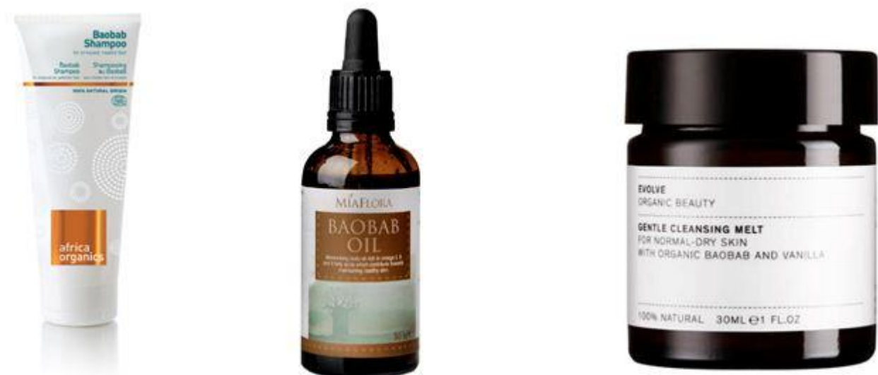
Figure 2: Examples of baobab oil products in the European cosmetics market

The main applications of baobab oil in the cosmetics industry are in body oils, face creams, moisturising lotions, massage oils, sun care products, bath oils, anti-ageing creams, face masks, shampoos, conditioners and nail moisturisers. Baobab oil is traded under the HS Code 15159090.