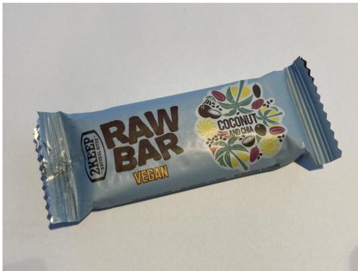
Figure 3: Example of a vegan raw bar with chia

people. Chia oil is still very niche. It is often sold as an omega-3 food supplement. The allowed uses in foods are still limited, but it also has potential in the non-food sector, such as a natural ingredient for cosmetics .