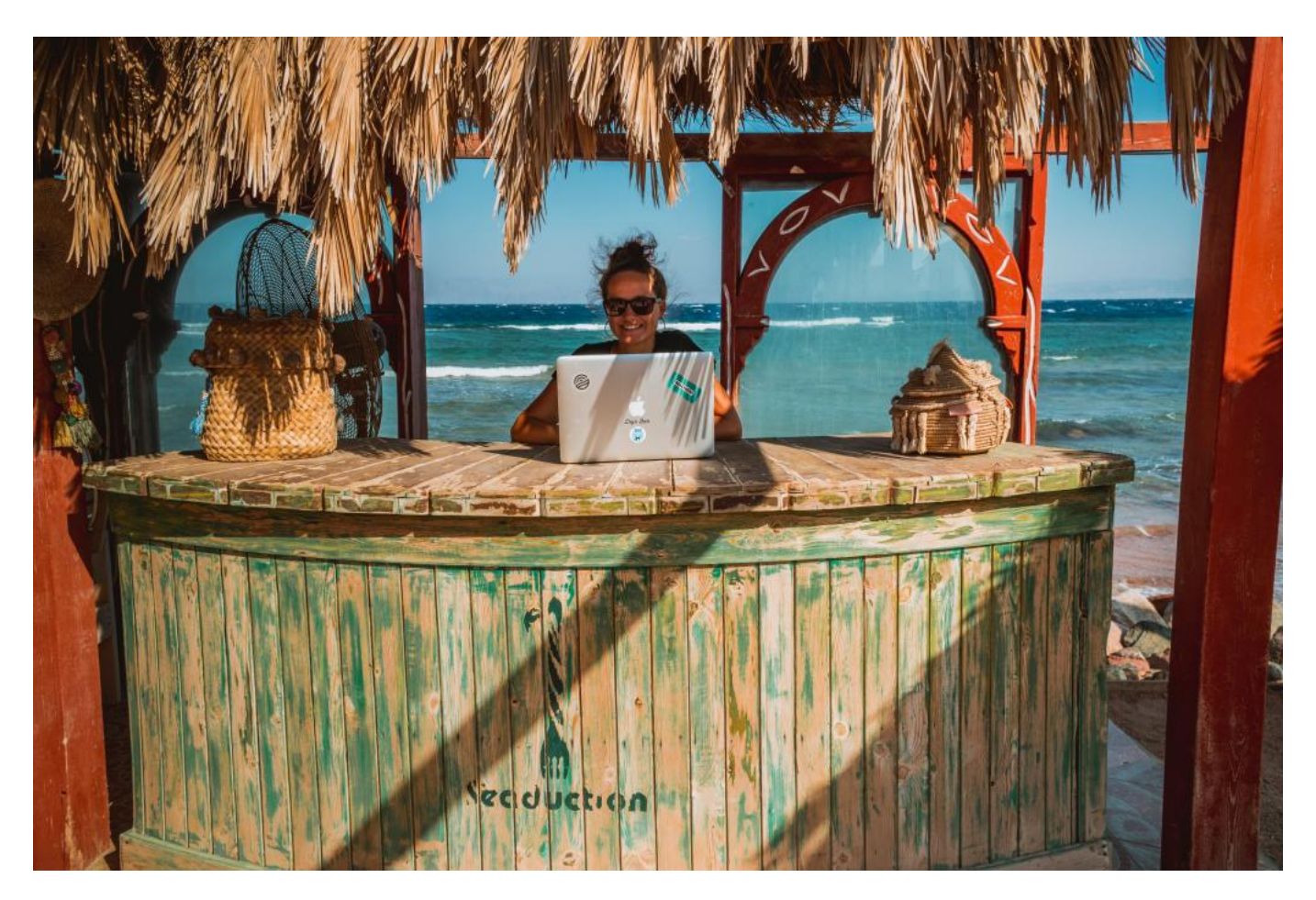
Figure 2: Digital nomads can work from anywhere

More and more countries are looking to the potential of special visas for extended stays for the people that have found they can work and travel for extended periods. Particularly with "workcations", the independent executive or worker that has no family or work commitments is already looking at service factors for a better work life balance instead of the rushed 7/10/14 day trip and barely any time to switch off in the middle. Therefore, if you can cater to this type of person with their strong internet desire, there may be a trend you can follow and offer relevant products.