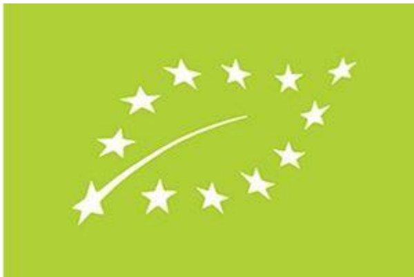
Figure 2: EU organic certification logo

Some industry experts suggest producers in developing countries should capitalise on this opportunity by getting EU organic certification for their Aloe vera . According to the feedback from the industry, there is a growing demand for organic Aloe vera on the European market. Natural & Organic Farms Mexico is an example of a company exporting both EU Organic and Ecocert -certified Aloe vera to the European market.