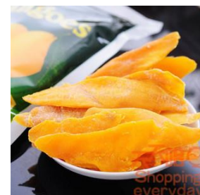
Dried mangoes from the Philippines

A rough indication of dried mango imports can be also derived from the statistics that are given in the module 'Promising EU export markets for fresh mangoes'