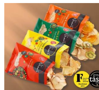
Dried fruit crisps (Nimms)

The UK is the second largest EU importer of dried fruit (38,394 tonnes in 2012) with a rather high share of dried mangoes in all dried fruit – see table 1. Firstly, dried mangoes are used in cereals, which is the most popular breakfast in the UK. Secondly, dried mangoes are eaten in slices or in thin crisps as a healthy snack at home, on-the-go, at the office or at the fitness centre. UK imports of dried fruit are expected to rise further to 43,560 tonnes in 2013.