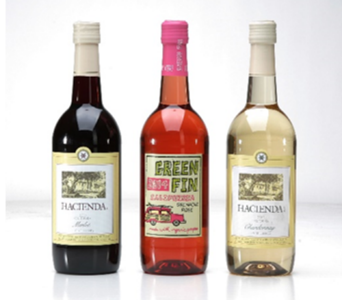
Figure 5: Example of Single-serve PET bottles