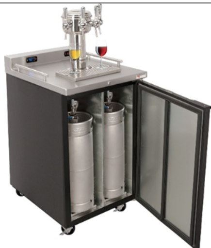
Figure 2: Example of a wine tap system with kegs