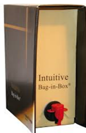
Figure 3: Example of Bag-in-box