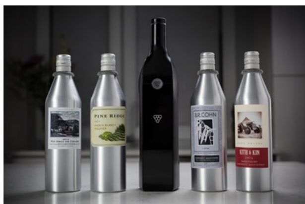
Figure 4: Example of premium packaging