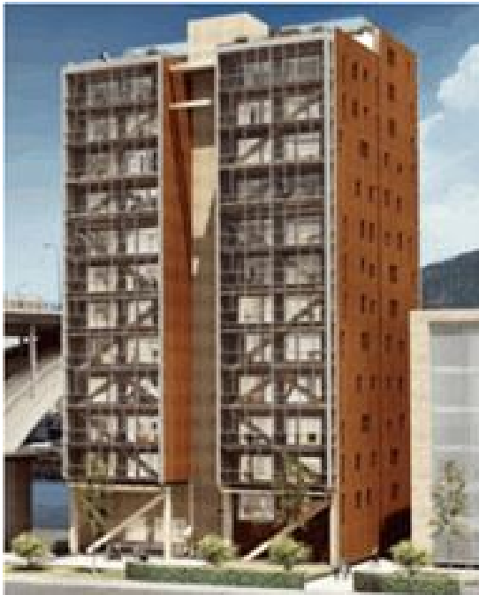
Figure 2: Bergen, Norway, highest building constructed with CLT

The DACH countries (Germany (D), Austria (A), Switzerland (CH)) have been the driving force in CLT development, not only as the originators of CLT products but also as the leading CLT producers. Austria has seven CLT production facilities, Germany three and Switzerland two. Minor production sites exist in Finland, Italy, Norway, Spain and Sweden, while more CLT factories are under construction in Finland, France, Sweden and the UK.