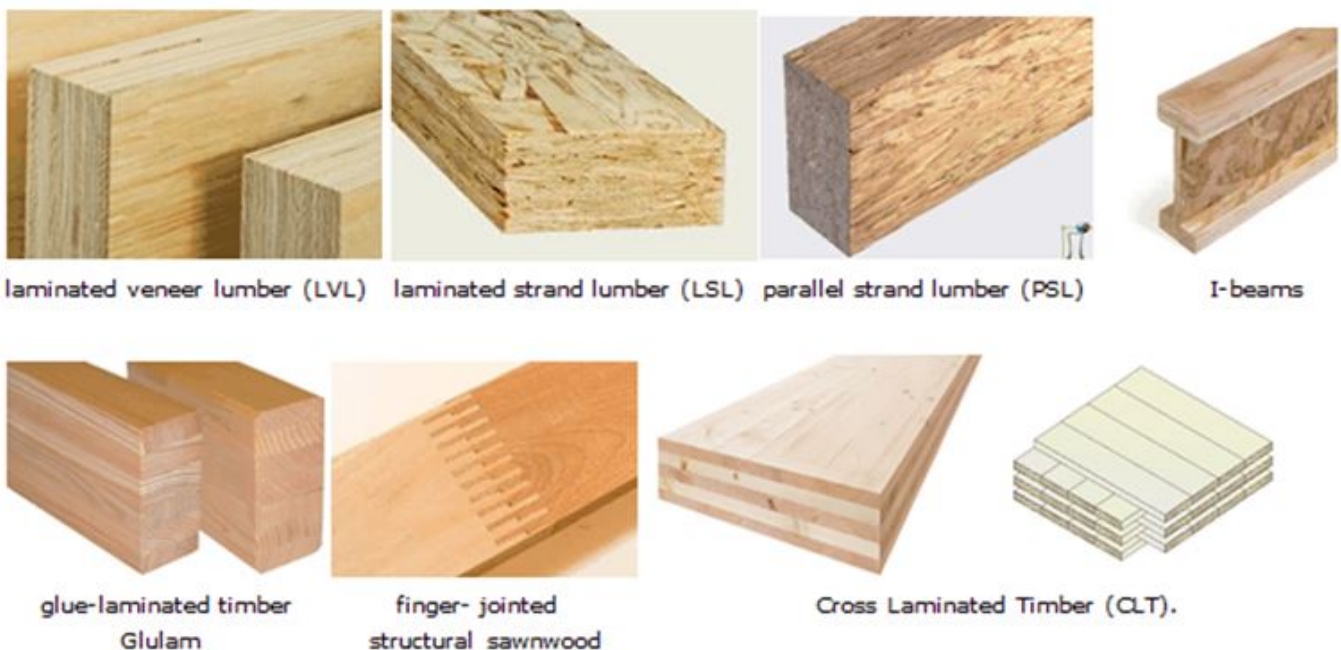
Figure 1: Examples of Engineered Wood Products (EWP)

In the EWP product group, several products are found: laminated veneer lumber (LVL), laminated strand lumber (LSL), parallel strand lumber (PSL), I-beams, glue-laminated timber (glulam), finger- jointed structural sawnwood and Cross Laminated Timber (CLT). This document is about Cross Laminated Timber (CLT) only.