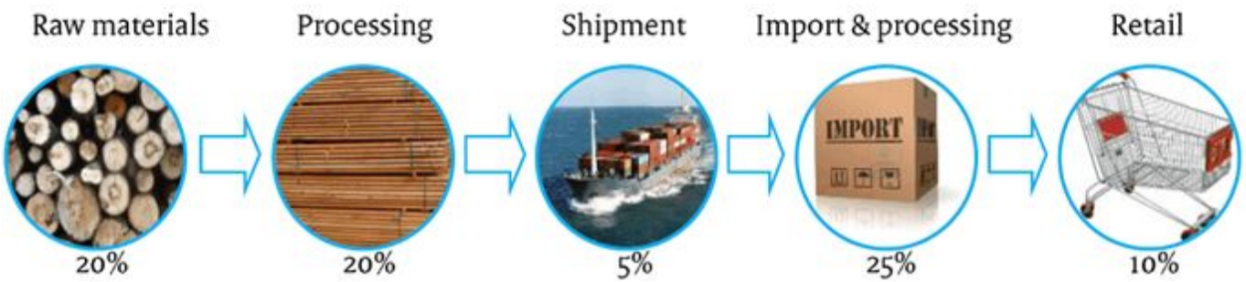
Figure 10: Price breakdown of imported wood products to the European Union (excluding VAT, average 20%)

If you decide to produce your own CLT and start exporting, the following factors will influence your price: availability of species, humidity levels (12%), durability class (density of the timber), quality (occurrence of stains, knots, end shakes, mould, warped boards, insect holes, breaks, repairs) and sustainability certification. If you start exporting from a developing country, the following price breakdown will be applicable.