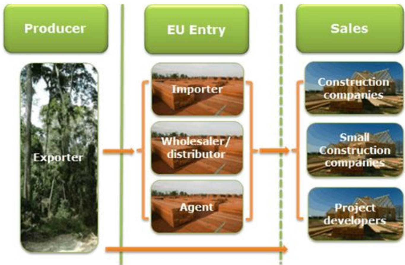
Figure 9: Trade structure for CLT

Exporters of CLT products mostly sell their products to importers, wholesalers/distributors or directly to construction companies or project developers (the role of the agent as an intermediary is decreasing). In turn, importers and wholesalers/distributors sell to construction companies and project developers.