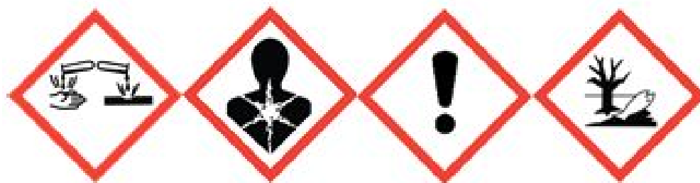
Figure 1: Hazard labels for rose geranium oil

include relevant hazard symbols (see Figure 1) to indicate that the oil may be fatal if swallowed and enters airways, is toxic to aquatic life with long lasting effects, causes serious eye damage, causes skin irritation and may cause an allergic skin reaction. You also need to include relevant risk and safety phrases.