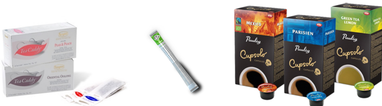
Figure 2: Different types of consumer packaging that make tea preparation easier