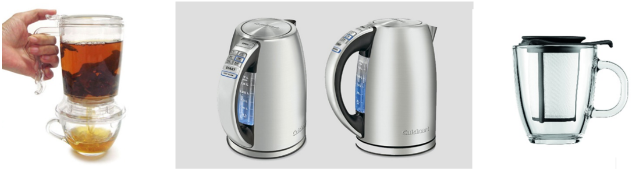
Figure 1: Different types of innovative tea brewing for consumers