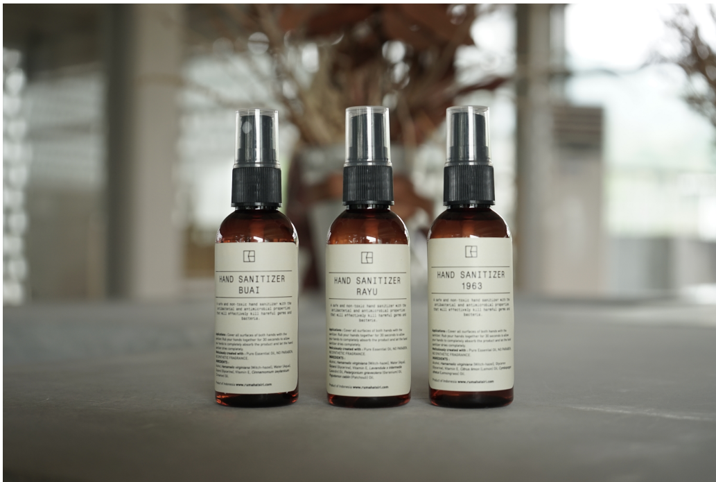
Rumah Atsiri hand sanitiser

A great example is the company Rumah Atsiri from Indonesia. It developed a special line of aromatic hand sanitisers with anti-bacterial essential oils to take advantage of the drop in demand for some of its other products. Besides donating the material in bulk to the local community, its well-designed product line also attracted attention from international buyers. This opened new markets for the company in a different product category.