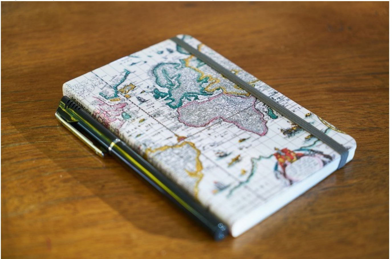
Image 2: Example of a notebook that can be used as a travel journal

Notebooks invite personal reflection. This makes the choice of notebook extremely individual. For this reason,, notebook users care about detail. Some websites even allow consumers to decorate their own notebooks.