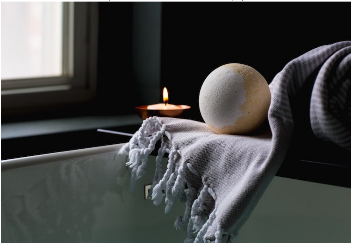
Picture 2: Hammam towels form a perfect fit with the wellness trend and spa practices

As typical wellness products, hammam towels can benefit from this trend. Especially in the higher market segments, catering to those who can afford luxury and spa products.